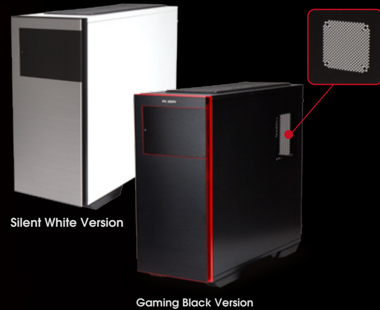
Silent White Version