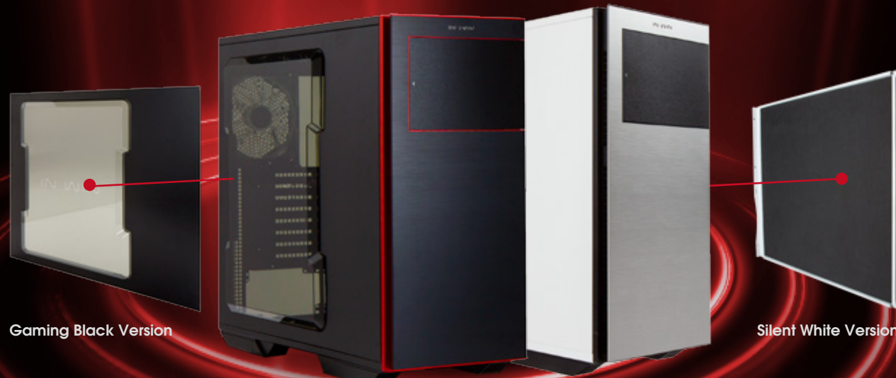
Gaming Black Version

Acrylic Side Window Panel with Side Fan Mount in Gaming Black Sound Damping Material on Side Panels in Silent White