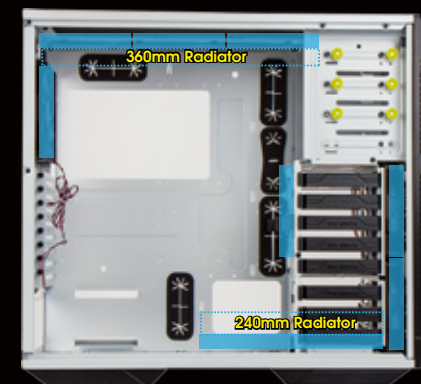
Silent White Version

Supports High-End CPU Heatsink for Effective Heat Dissipation (Supports CPU Heatsink up to 206mm in Gaming Black Version) (Supports CPU Heatsink up to 190mm in Silent White Version)